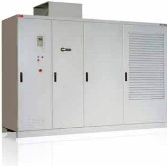
ABB has the complete range of products to supply drive systems including transformer, frequency converter and motor.

They are available with air or water cooling and with different line supply connection options. Some products offer the possibility to have the input transformer integrated or to operate direct-to-line without an input transformer thereby saving weight and space.