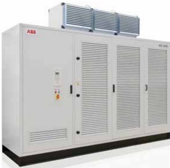
ABB medium voltage AC drives