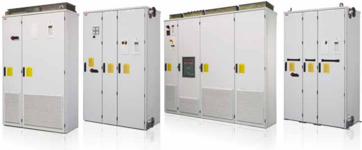
ABB low voltage AC drives ABB industrial drives