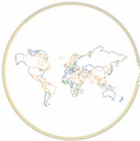
ABB technical partner network

The ABB global technical partner network brings ABB's products and services straight to your front door. The partners have in-depth knowledge of local markets and are conversant with the ABB low voltage drives products and processes. Many of them also have extensive industry and application knowledge and experience.