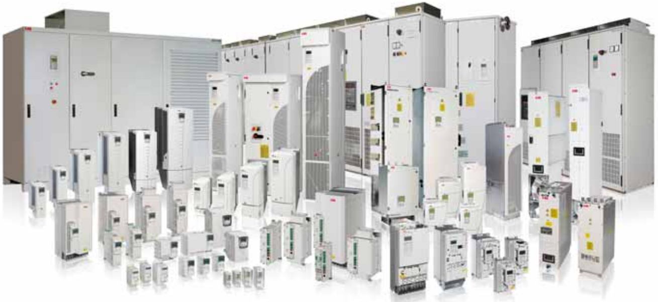
ABB machinery drives