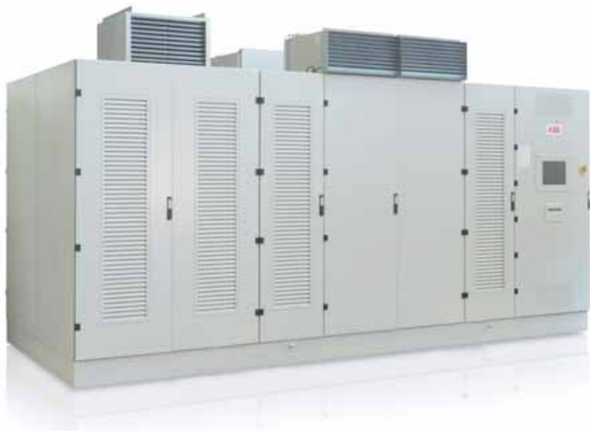
ABB medium voltage AC drives