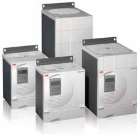
ABB DC drives are available as regenerative or non-regenerative drives. ABB offers digital DC drives for typical OEM applications up to complete drive solutions in cabinets. The drives can be also used in revamp or upgrade solutions. Power range is from 9 kW up to 12-pulse systems with 18000 kW.