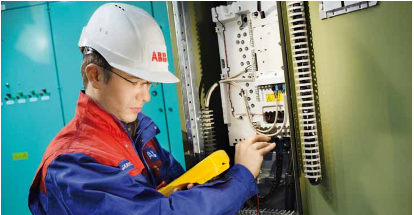
ABB has amassed a wealth of expertise on all aspects of drive systems applied to many different applications across most industries. Its dedicated experts talk your language and can offer the quickest route to a profitable solution, without forgetting personnel safety and environmental responsibility.