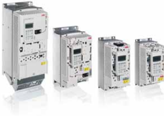
ABB single drive modules are designed for fast, cost effective installation and integration into a customer's own cabinet. Modules enable OEMs, system integrators and panel builders to build their own drive while benefitting from ABB drives technology such as DTC motor control, adaptive programming and a wide range of built-in and external options. ABB provides detailed cabinet installation instructions and other support material to help customers build their own solutions.