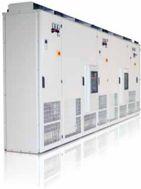
ABB DC drives