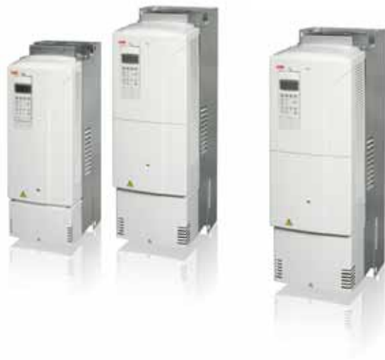
ABB low voltage AC drives ABB industrial drives